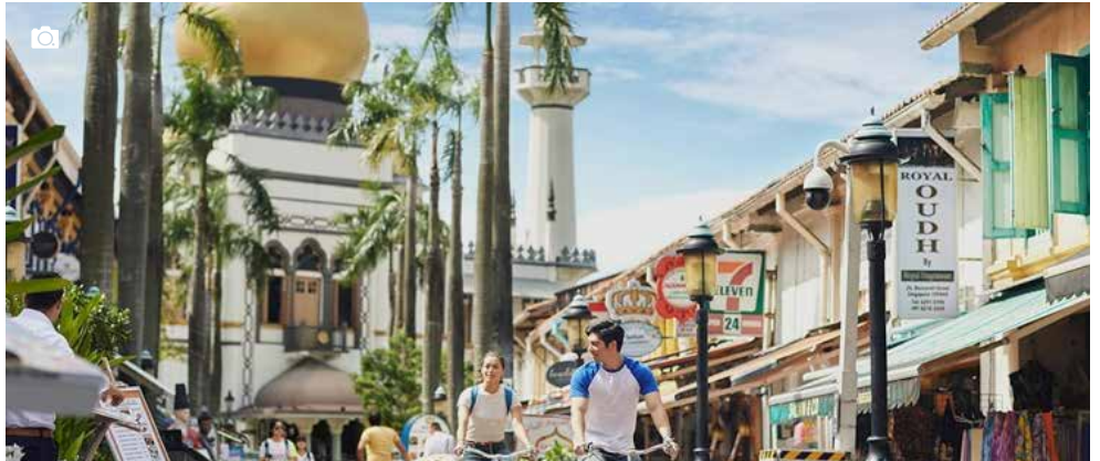
Singapore's delicious hawker fare, world-class parks and charming precincts like Kampong Gelam can all be experienced without having to splurge.

Discover Singapore's rich culture, sumptuous cuisine and unforgettable sights without burning a hole in your wallet.