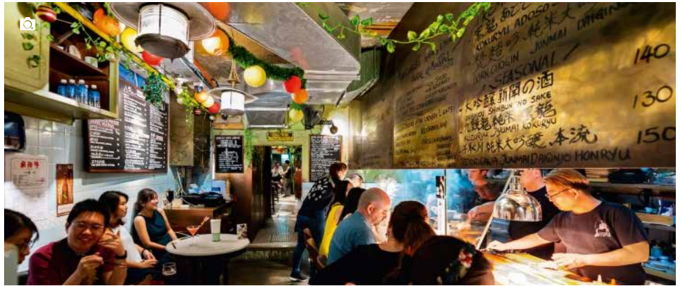
One of Singapore's oldest neighbourhoods, Tiong Bahru exudes a unique blend of modern and traditional, with indie boutiques and hip restaurants like Bincho.

In town for a short while? Shop, eat, and play with this detailed 3-day itinerary and enjoy the best of Singapore.